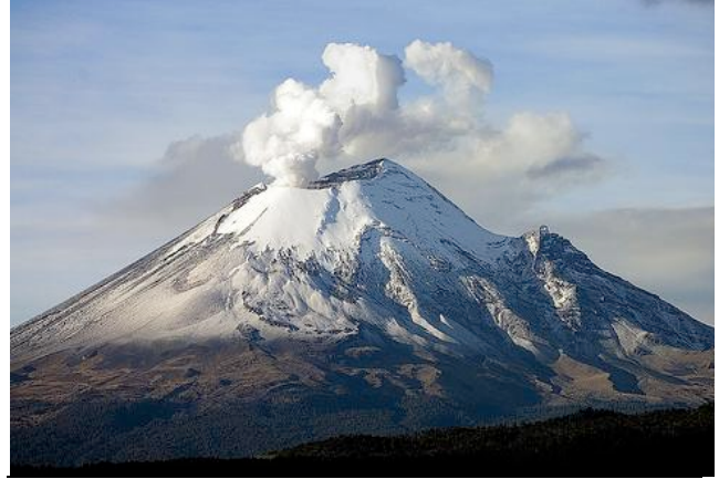
Popocatepetl puffing