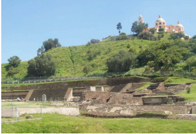
The Great Pyramid at Cholula